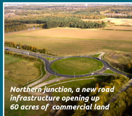
Northern junction, a new road infrastructure opening up 60 acres of commercial land