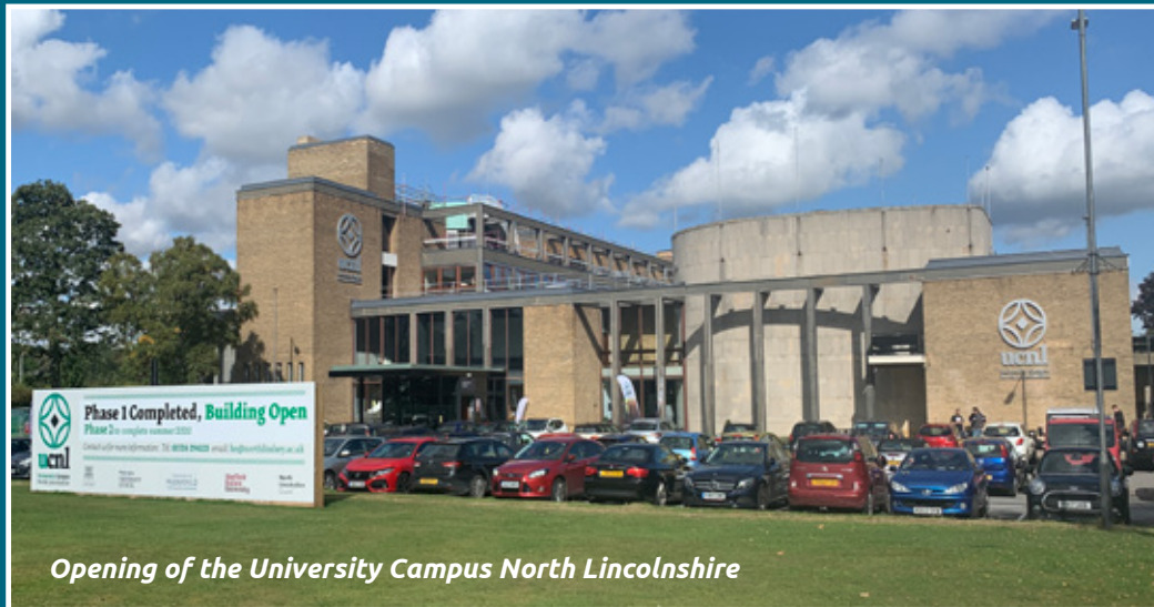
Opening of the University Campus North Lincolnshire