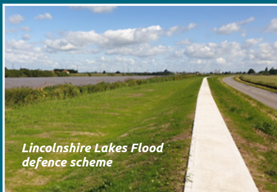
Lincolnshire Lakes Flood defence scheme